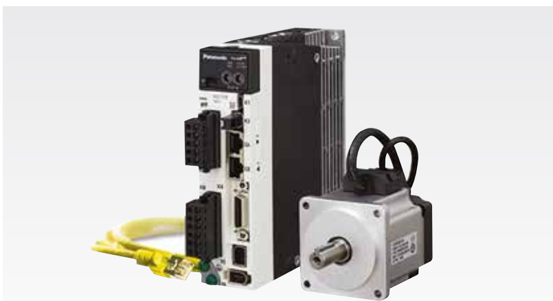
Panasonic servo motors and EtherCAT network type drives