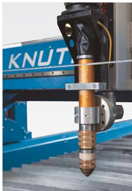
Optimum track speed even for fine contours and tight radii

Table prepared for filter system (automatic closure control), Eckelmann Servomotors and drivers, Automatic burner height control from Eckelmann, Cutting torch with magnetic coupling and crash sensor, Eckelmann CNC-Unit, 19" Touchscreen from ELO, A-Modul from Beckhoff, Laserpointer, Libellula Wizard PRO, Libellula.CAD 2D