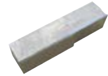
Legacy standard HSS tool bit 9.5 x 9.5mm