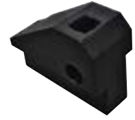
Legacy single point beveling tool holder