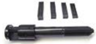
SDB 412 / FF 424 Mandrel Kit