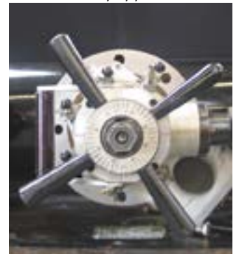
Convertible to SDB series end prep