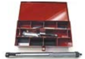
SDB 103 / FF 206 Mandrel Kit