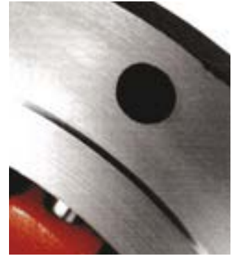
Lathe quality surface finish