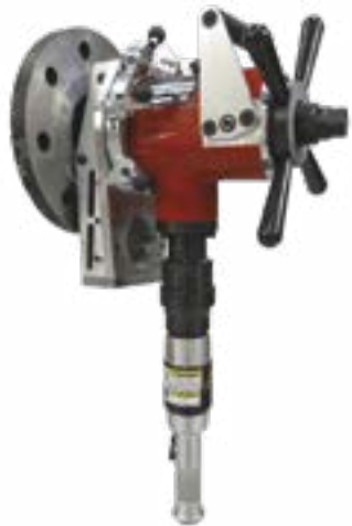
FF Flange Facer 313