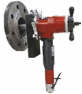
FF Flange Facer 206

Flange facing machine for facing flat, raised or recessed face flanges from ID 4in (101.6mm) through OD 24in (609.6mm)