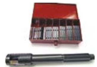
SDB 206 / FF 313 Mandrel Kit