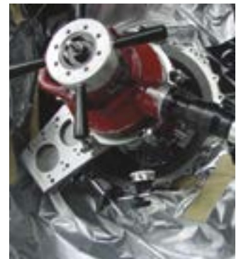
Based on powerful SDB end prep platform