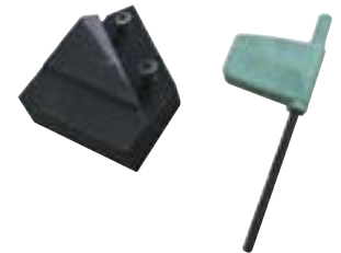
Bevel tool insert holder kit 37.5°