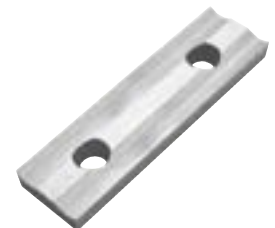
Premium grade HSS insert (2 sided)