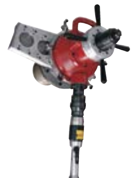
FF Flange Facer 424