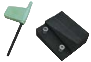
Facing tool insert holder (high range)