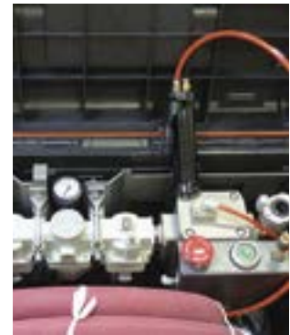
Ergonomic fingertip control with safety stop button