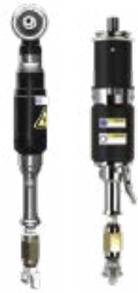
Pneumatic drive motors

E.H. Wachs offers remote control options available for all three drive types.