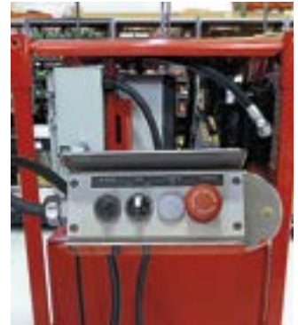
Powerful HPU-20 with standard remote control pendant