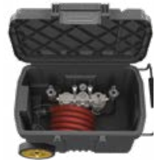
Air Treatment Module ATM