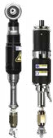
Pneumatic drive motors are available in straight & right angle models