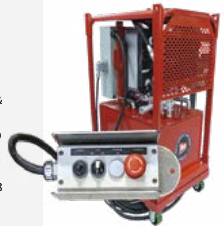
Heavy Duty Electric HPU-20