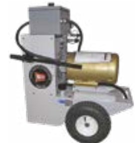
Electric Hydraulic Power Unit