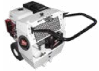
Cart Mounted, Gasoline Fueled Hydraulic Power Unit

Rated for 15 GPM @ 1500 PSI (56.8 LPM @ 103 BAR)