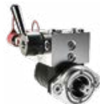
Hydraulic drive motor