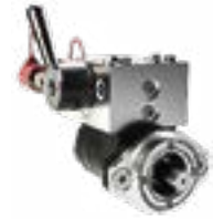
Hydraulic drive motors with flow control