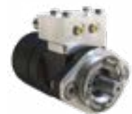
Hydraulic Drive Motor without flow control for use with HPU-20