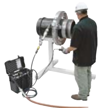
ACM controlling Split Frame