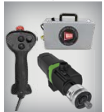
Eibenstock HD available with or without remote control