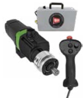
Provides electric power with remote control options available