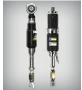
Pneumatic straight and right angle 6B spline drive motors