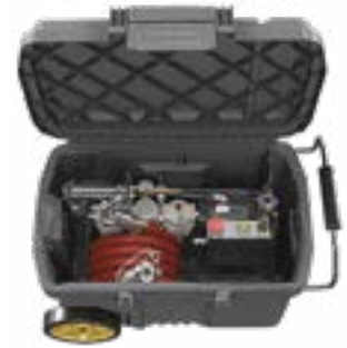
Air Control Module ACM for pneumatic motors