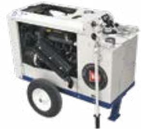
Diesel D23 Hydraulic Power Unit