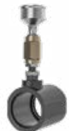
Straight Drive Meter-Out Adapter Kit